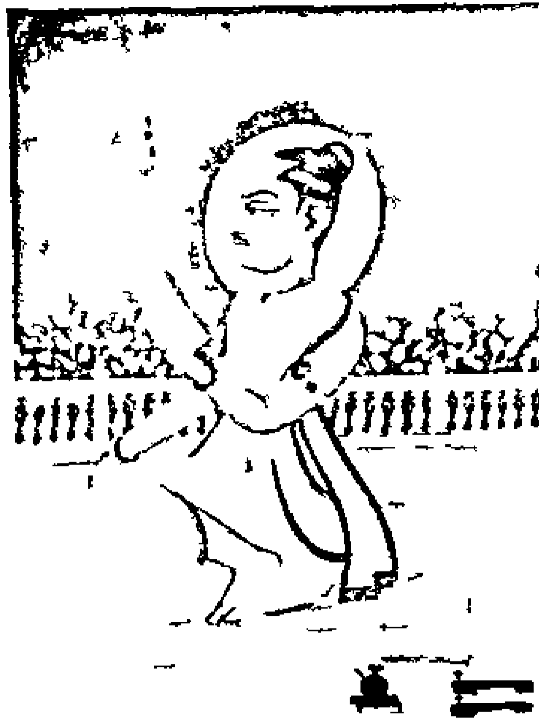
Goswami Shri Gokulnathji See page 343